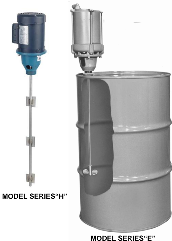
MODEL SERIES "H"

Series E & H Mixers are designed for economical mixing of closed head steel drums. The mixer mounts by screwing into the 2" bung opening. The folding propeller collapses to allow entry through the 2" bung and opens when operating to provide thorough mixing. The unit can be conveniently moved from one container to another.